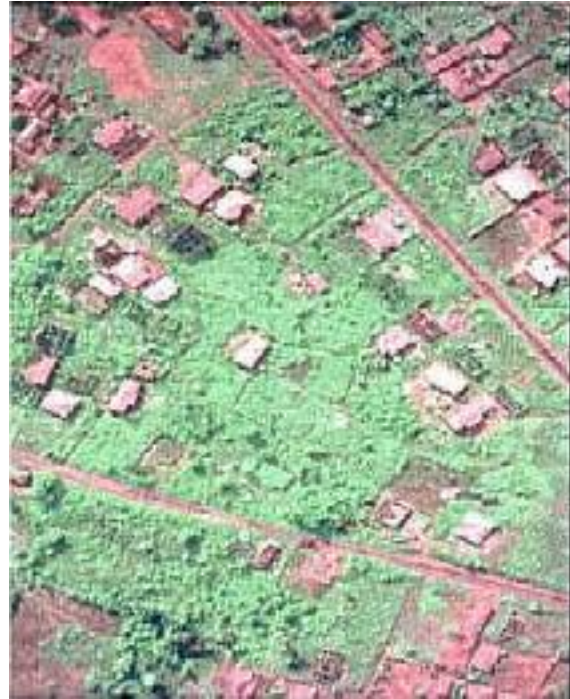
Photo 1: Organisations involved in natural resource management can gain access to the KUMINFO database and services, such as this digital photograph showing a portion of the layout of Aburaso village.

The issue of cost recovery for project staff and equipment is still to be addressed.